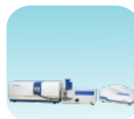
Laser Particle Size Analyzer